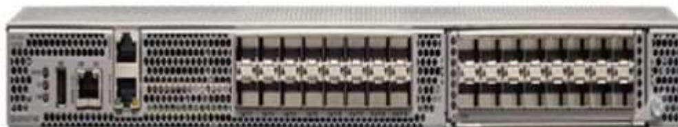
HPE Storage Fibre Channel Switch C-series SN6610C

The HPE Storage Fibre Channel Switch C-series SN6610C can be provisioned, managed, monitored, and troubleshoot using Cisco Data Center Network Manager (DCNM), which currently manages the entire suite of Cisco data center products. Powered by C-series MDS 9000 NX-OS Software, it includes storage networking features and functions and is compatible with C-series SN8500C/SN8700C (MDS 9700) Series Multilayer Directors, C-series SN6620C (MDS 9148T) Multilayer Fabric Switches, C-series SN6630C (MDS 9396T) Multilayer Fabric Switches, C-series SN6010C (MDS 9148S) Multilayer Fabric Switches, C-series SN6710C (MDS 9124V) Multilayer Fabric Switches, C-series SN6720C (MDS 9148V) Multilayer Fabric Switches, C-series SN6730C (MDS 9396V) Multilayer Fabric Switches, and C-series SN6640C (MDS 9220i) Multi-service Fabric Switches providing transparent, end-to-end service delivery in core-edge deployments.