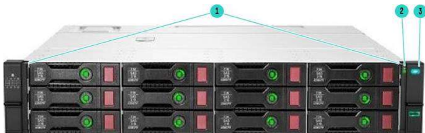
HPE D3610 Enclosure (LFF)