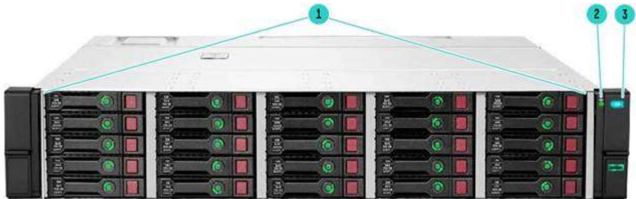
HPE D3710 Enclosure (SFF)

See the Windows Server Catalog for the latest supported configurations. Total support can grow as needed to up to 96 LFF drives or 200 SFF drives.