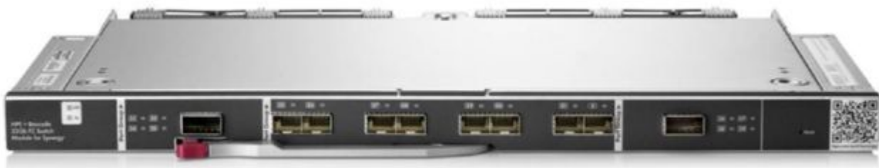
Brocade 32Gb Fibre Channel SAN Switch Module for HPE Synergy